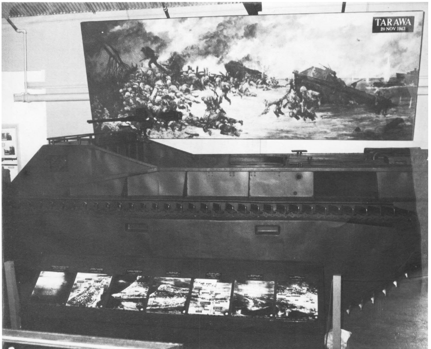
A restored LVT-1 and .50-caliber Browning machine gun are featured in the World War II hangar. Col Charles Waterhouse's recreation of the Tarawa battle is the backdrop.