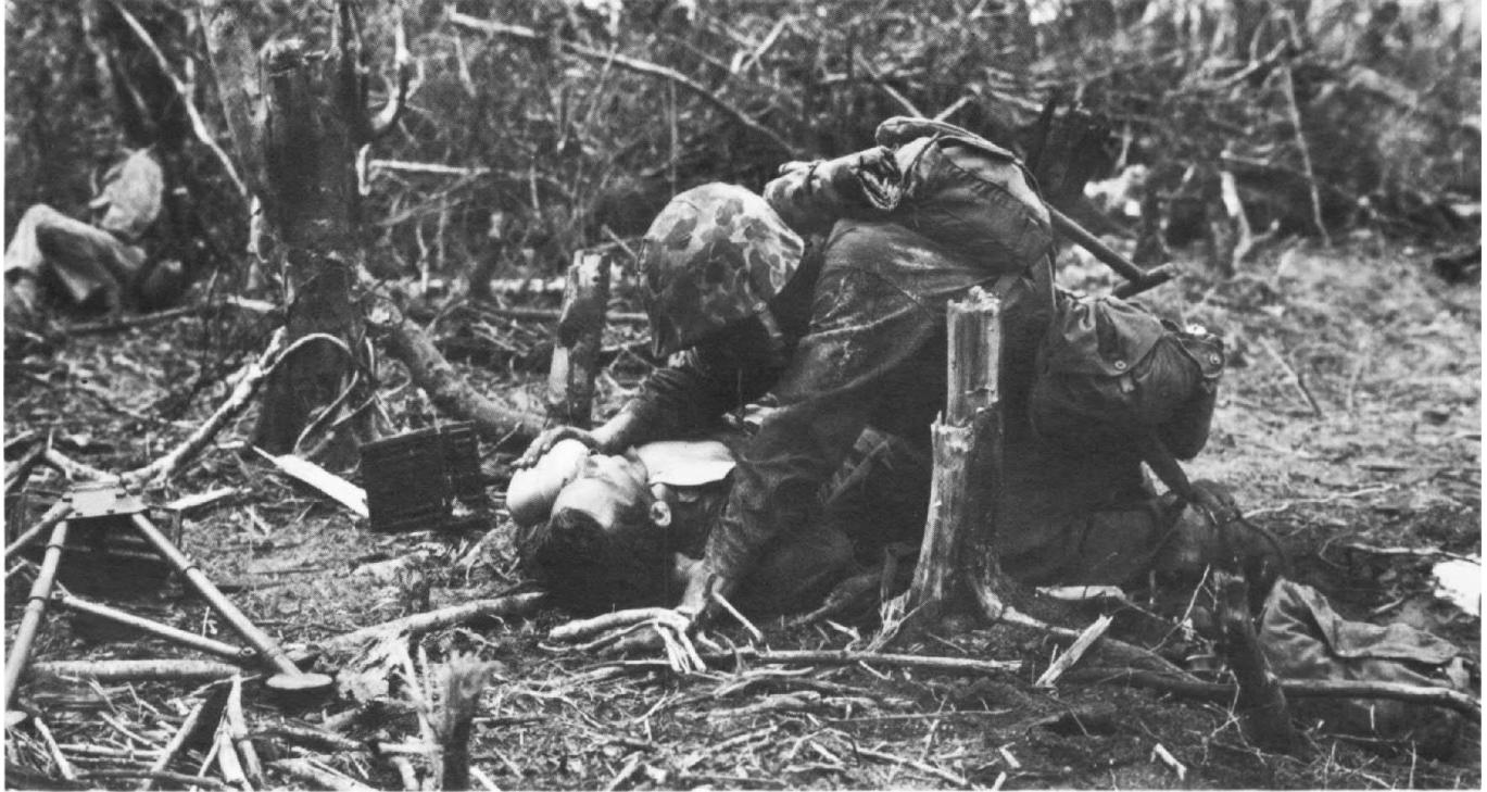
A buddy provides a drink of water from his canteen and comforting words to a wounded 1st Division Marine awaiting stretcher bearers amid the shattered underbrush of Peleliu Island.

withdrawing from Leyte. Later, with planes from Marine Fighting Squadrons 218 and 313 and Army P-40s, they sunk a troop transport and damaged two destroyers of the convoy.