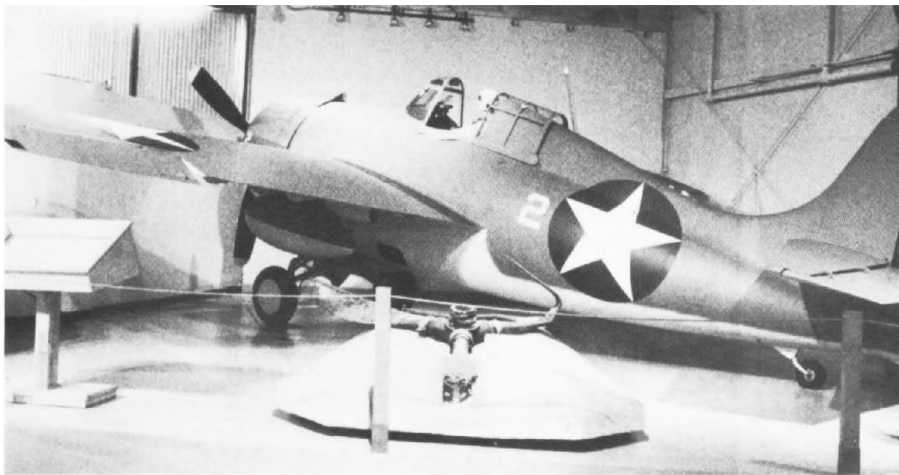
The Wildcat's ruggedness and firepower enabled it to compile a distinguished record. This F4F-4 (BuNo: 12114) is the only one known to exist in the United States.

The Marine Corps Museum's Wildcat is the only F4F-4 known to exist in the United States. It carries bureau number 12114, and it was acquired from Seattle Community College in 1968. —FMB