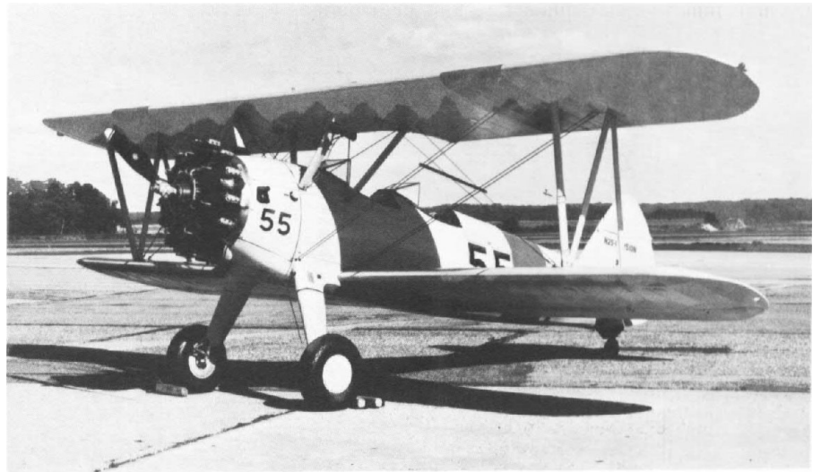
A new acquisition for the Museum at Quantico is the Stearman N2S-1 "Kaydet" biplane trainer (BuNo: 75-3030), in which a generation of naval aviators learned to fly.

A historic presentation of the Marine Corps' participation in the Korean and Vietnam Wars remains for completion, principally because of the lack of ade-