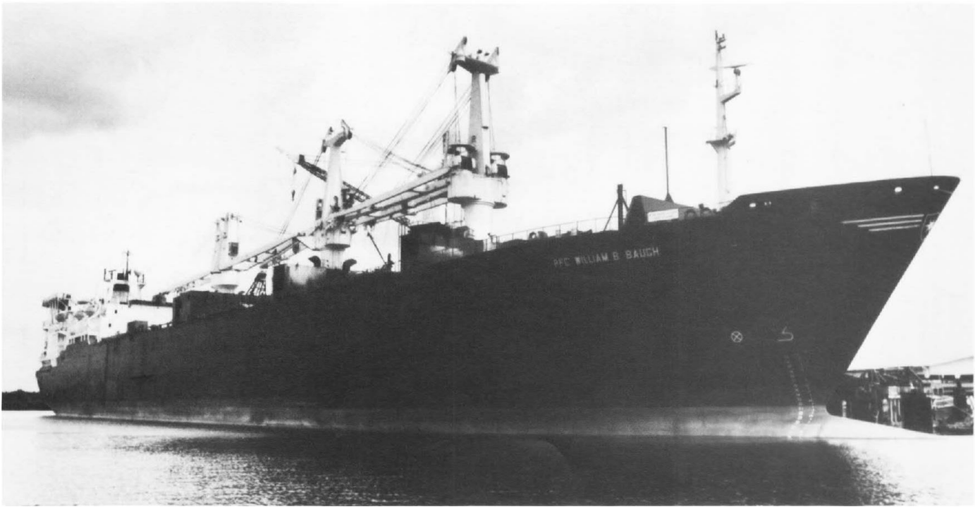
The PFC William B. Baugh, renamed in ceremonies held on 22 September 1984 in Beaumont, Texas, is the second of five Maritime Prepositioning Ships (MPS) being converted for the Maersk Line by Bethlehem Steel Corporation. Altogether there are 13 ships in the MPS program, all named for Marine Corps Medal of Honor recipients.