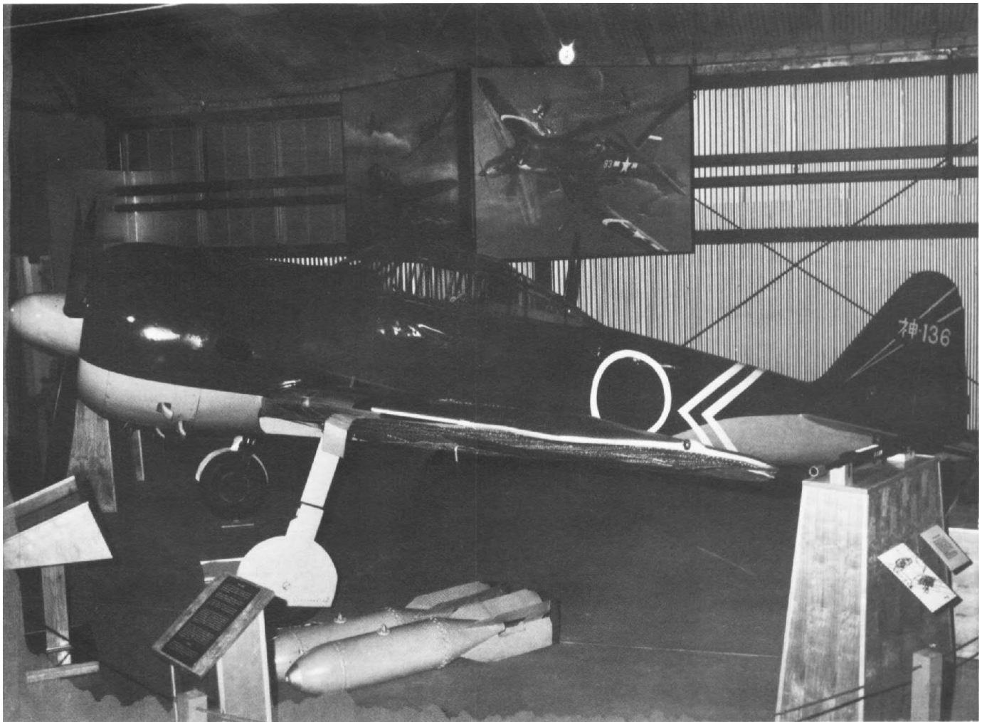
This partially restored Nakajima A6M2 "Zero" was salvaged from an abandoned Japanese airbase in the Solomons, and is reported to have joined in the Pearl Harbor strike.

quate display and storage space. As a result, current emphasis is on acquiring only the mainstream aircraft and ground equipment of these respective eras. Two modest structures are available and projected to house Korea and Vietnam exhibits, but considerable facilities maintenance must be accomplished before display work can begin. At best, the use of these small hangars will be only temporary expedient, to allow these important chapters in Marine Corps history to be outlined. With indoor space to house only about eight Korean-era and five Vietnam-era aircraft, interspersed with associated ground equipment, these projects present a considerable challenge.