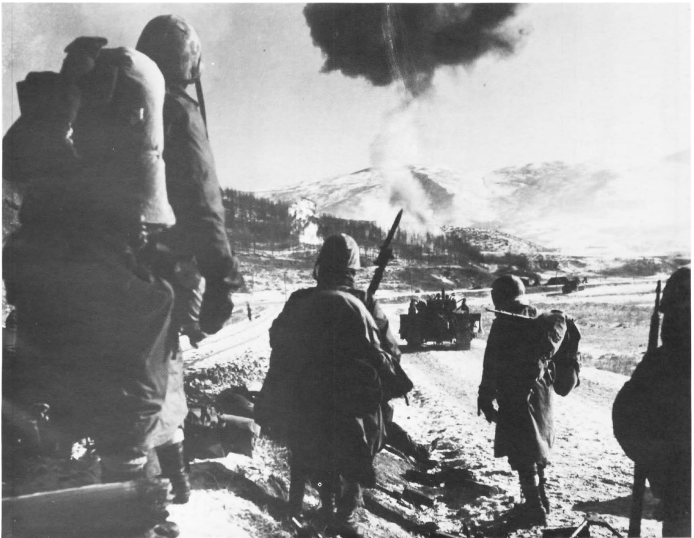
This photo, taken 6 December 1950, looks south from Hagaru-ri along the road from Koto-ri which was the route taken through Hellfire Valley by Task Force Drysdale on 29 November in its successful but costly effort to reinforce beleaguered Hagaru-ri. PFC Baugh, a rocket launcher gunner from 3d Battalion, 1st Marines, died in that effort.

The Eleo Maersk during its conversion into the PFC William B. Baugh was cut in half and a new 157-foot-long mid-section inserted so that it grew in overall length from 598 feet to 755 feet. Two new deck levels were added. Other major additions included new ramps, repair shops, and an aft helicopter landing platform. The rebuilt ship has a beam of 90 feet, and a draft of 33 feet. Its seven-cylinder Sulzer slow-speed diesel engine at 80 percent horsepower will push it along at 17.2 knots. Endurance will be 10,800 nautical miles. It will displace 28,249 long tons empty and 46,484 tons