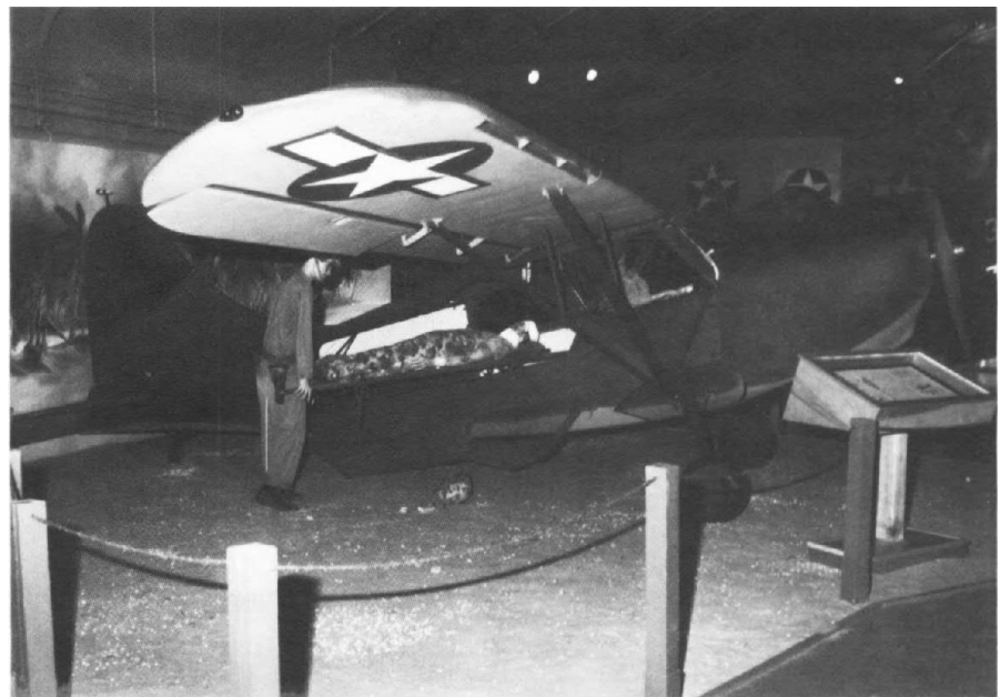
Full-scale diorama at Quantico pays tribute to pioneering battlefield medevac efforts, with an OY-1 (BuNo: 120454) taking a wounded Marine aboard in World War II.

Looking into the future, a single-site "big top" museum to house these exhibits is needed if the story of the Corps' doctrinal history and its battlefield heroes is to be told in a worthy setting.