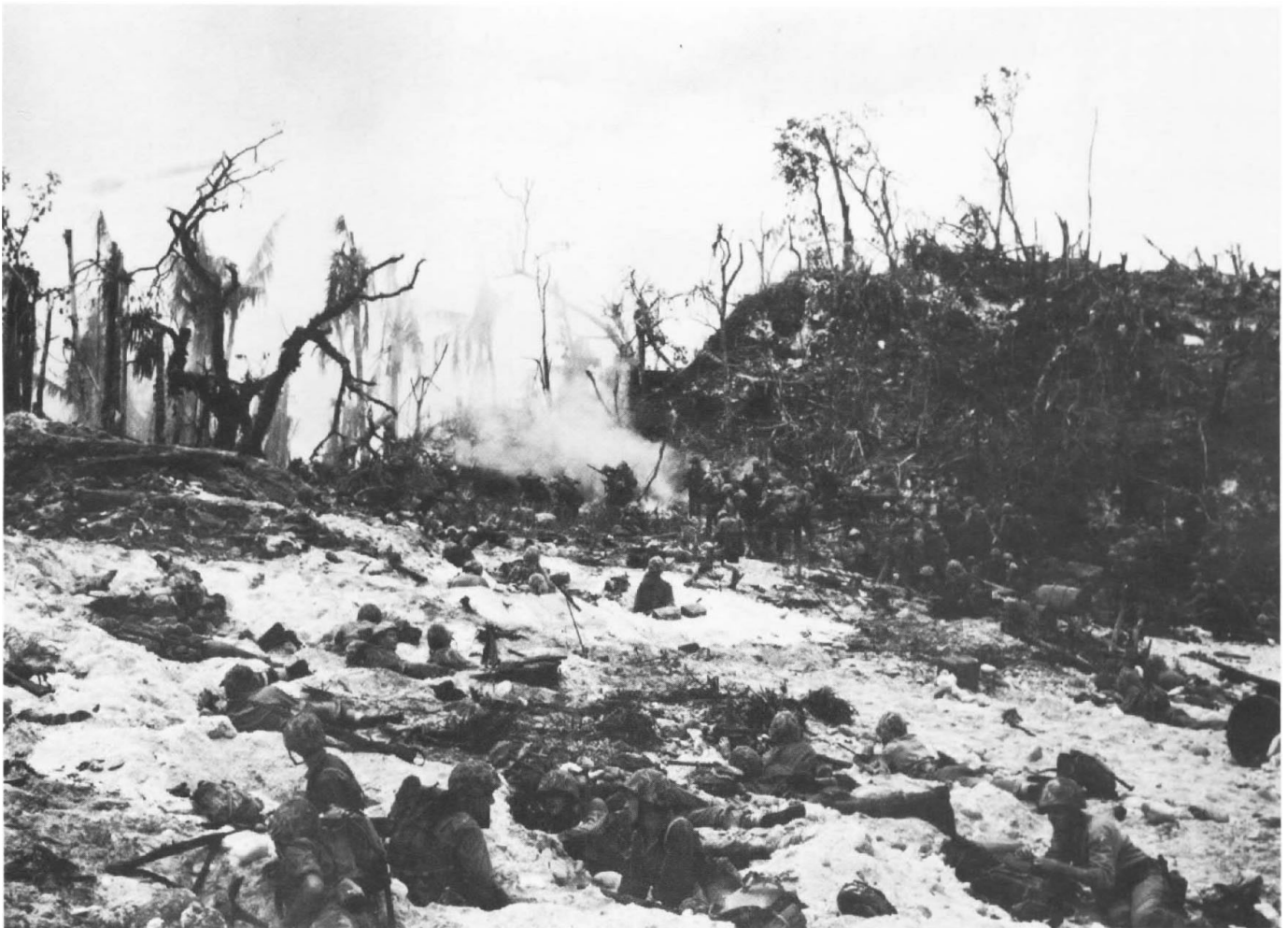
Dispersed over the explosives-ravaged terrain of Peleliu in the Palau Islands, men and artillery of the 1st Marine Division advance from dug-in positions in the battle of September 1944.

25 September. An Army task force, seized Hill B, south of Hill 100, isolating the Japanese pocket of resistance on the northwest peninsula, and the 5th Marines attacked toward the tip of the peninsula and established a perimeter there.